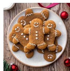
Bake some Gingerbread Men