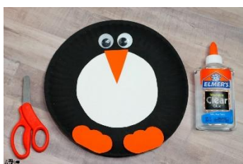
Make your own paper plate penguin