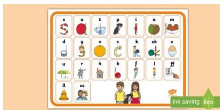
Practise your letters