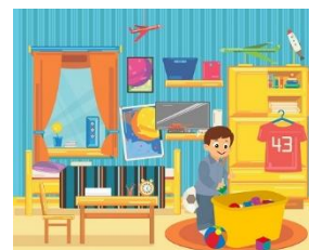
Help keep your bedroom tidy